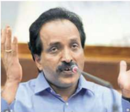
Indian Space Research Organization chairman S. Somanath.

telecommunications has pitched for auctioning of airwaves, the TRAI is yet to come up with its recommendations on the method of allocation of spectrum. Through effective deployment of spectrum, the government also aims to ensure convergence of emerging technologies. For example - compatibility of devices such as smartphones to support both terrestrial networks as well as satellite communication services.